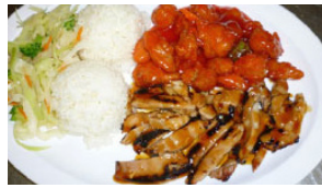
Sweet & Sour Chicken & Teriyaki