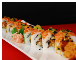
Miss USA Roll